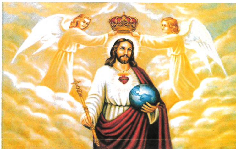
OUR LORD, JESUS CHRIST, KING OF THE UNIVERSE

Make sure to remember the retired priests of our Diocese by making a gift to the Endowment Fund for the Care of Retired Priests. This special fund is used to directly support retired priests in good standing including the future costs of their healthcare, insurance, and housing and sustenance. Please return your gift using the envelope you received in the mail. These envelopes may be returned in the mail or in the collection basket at Mass. For more information, visit the website www.weloveourpriests.org . Your generosity supports retired priests from all five counties of our Diocese!