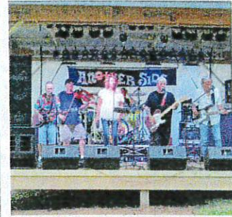
Another Side Aug. 3rd ~ 7-11 p.m.