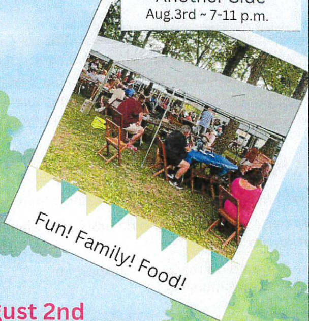
Fun! Family! Food!