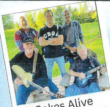
Sakes Alive Aug. 2nd ~ 7-10 p.m.