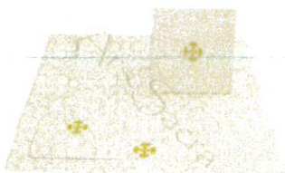
Burse, maniple, chalice veil set (cream, red, rose, purple, green)

(Semi-Gothic, cream, red, rose, purple, green)