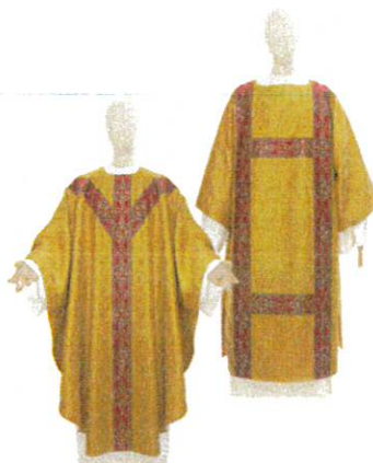
pictured: Holy Day chasuble and dalmatic