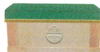
Altar Cloths** (cream, purple, red, green)