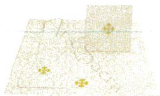
Burse, maniple, chalice veil set (cream, red, rose, purple, green)