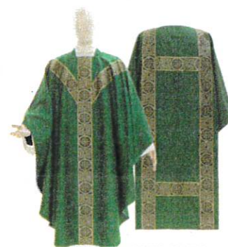
Vestments (dalmatics)** (Semi-Gothic, cream, red, rose, purple, green)