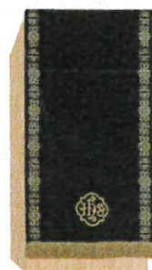
Lectern Hanging** (cream, red, purple, green)

pictured in black, but will be cream with black and gold stripe