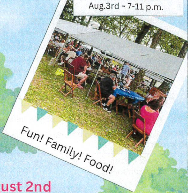
Fun! Family! Food!