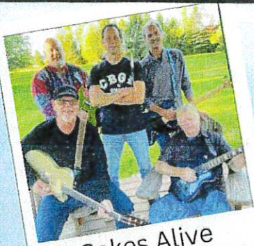
Sakes Alive Aug. 2nd ~ 7-10 p.m.