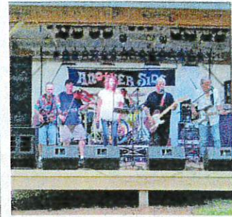
Another Side Aug. 3rd ~ 7-11 p.m.