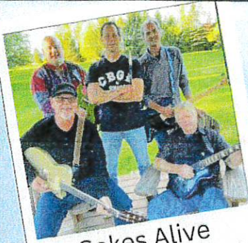
Sakes Alive Aug. 2nd ~ 7-10 p.m.