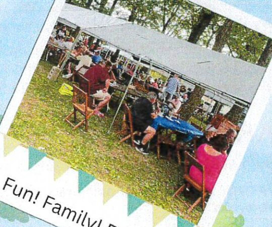
Fun! Family! Food!