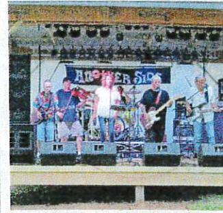
Another Side Aug. 3rd ~ 7-11 p.m.